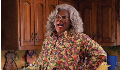
Tyler Perry as Madea (a screen character)